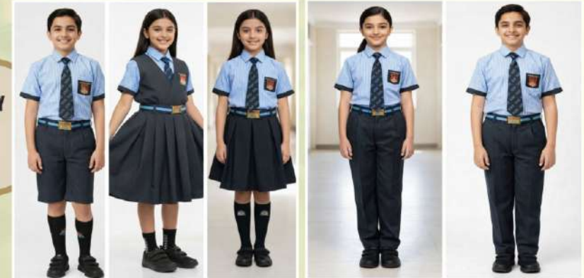
1ST TO 5TH 1ST and 2ND 3RD TO 5TH