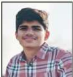
2025-26 DASHRATH CHOUDHARY JEE (MAIN) 99.62%